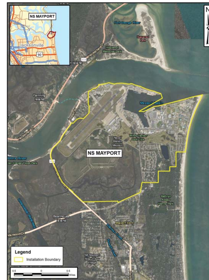
Figure 1- NS Mayport

To be protective, the Navy will provide bottled water for drinking and cooking to any resident in the sampling area whose private well contains PFOA and/or PFOS above the EPA lifetime health advisory levels. The Navy will provide bottled water until a long term solution is implemented.